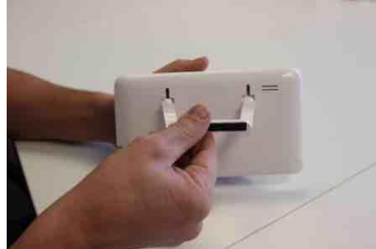
Connect table stand to upper holes on the back of the device and snap into place