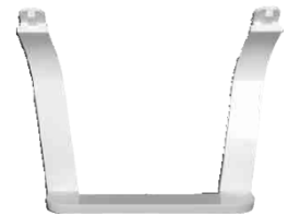
Optional Table Stand