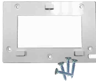
Wall Mount Bracket and screws