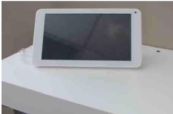
Choose your location