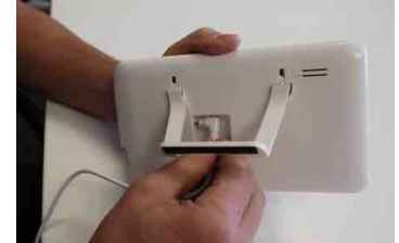
Connect your power supply